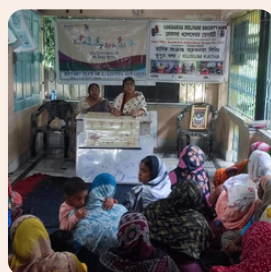
SESSION ON IMPORTANCE OF EDUCATION AND DONATION OF WHITE BOARD AT RCC LOKSAKHA WELFARE SOCIETY- 19TH AUGUST 23