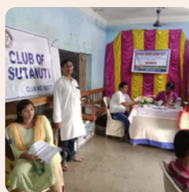
EYE CHECK UP CAMP AT RCC PATHER DISHA 29.9.23,