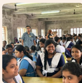
WORLD LITERACY DAY - SESSION ON BRINGING BACK DROP OUT CHILDREN TO SCHOOL AT BALLY GIRLS HIGH SCHOOL- 7. 9.23