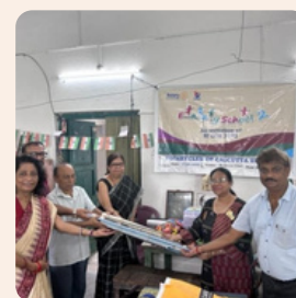
DISTRIBUTION OF EDUCATIONAL STATIONERY AT KALYANI CLUB- SEPTEMBER 2023