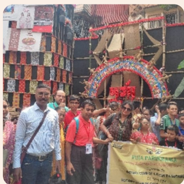
PUJA PARIKRAMA FOR MENTALLY CHALLENGED PERSONS 18.10.23