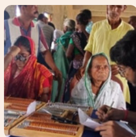
EYE CHECK UP CAMP- SULKIN PASCHIMPARA, HASNABAD, 27.9.23,