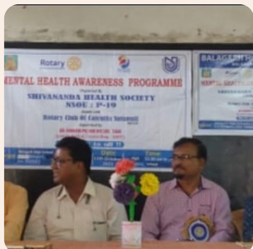
MENTAL HEALTH WEEK - AWARENESS SESSION BALAGARH HIGH SCHOOL 200 STUDENTS 11.10.23