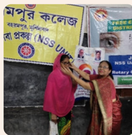
SPECTACLES DISTRIBUTED TO 138 PERSONS AT BERHAMPORE, MURSHIDABAD- 12TH AUGUST 2023