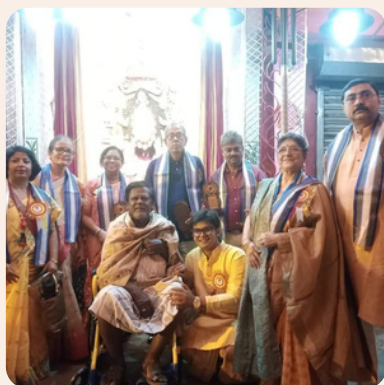
WHEEL CHAIR DONATION 10.11.23