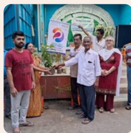
50 SAPLINGS GIVEN TO RCC RABITIRTHA ASHAR - 6TH AUGUST 2023