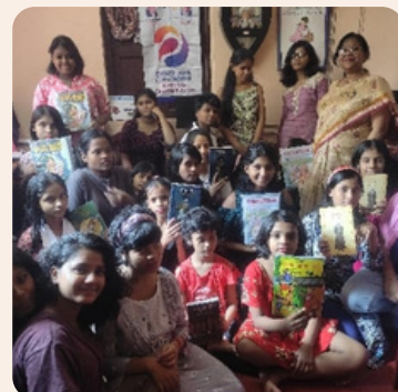
BOOKS AND NEW CLOTHES DISTRIBUTED AT KRITIKA PROTECTION HOME, BEHALA- 15. 10.23