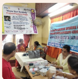
WORLD HEART DAY - PROJECT POSITIVE HEALTH, 29.9.23