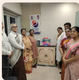
DONATION OF TOYS AT TOY BANK AT NETAJI SUBHASH CHANDRA BOSE CANCER HOSPITAL- 4TH AUGUST 2023