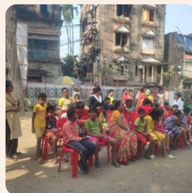
FIRE CRACKERS AND SWEETS DISTRIBUTED TO 100 CHILDREN AT GARPAR MANICKTALA 12.11.23