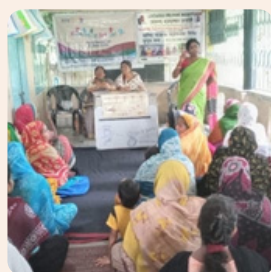
AWARENESS SESSION ON MENSTRUAL HYGIENE AND DISTRIBUTION OF SANITARY NAPKINS AT RCC LOKSAKHA WELFARE SOCIETY- 19. 8.23