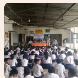
MENTAL HEALTH AWARENESS SESSION FOR PRIMARY AND HIGH SCHOOL STUDENTS OF BALAGARH JATINDRAMOHAN SCHOOL-100 STUDENTS- 4.10.23