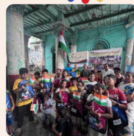
EDUCATIONAL KITS DISTRIBUTED TO 30 CHILDREN IN KALIGHAT -15TH AUGUST 23