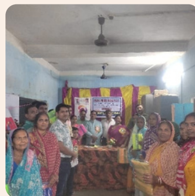
MOSQUITO NETS DISTRIBUTED TO 70 FAMILIES AT RC PATHER DISHA, GUMUKBERIA, KULPI, 5.11.23